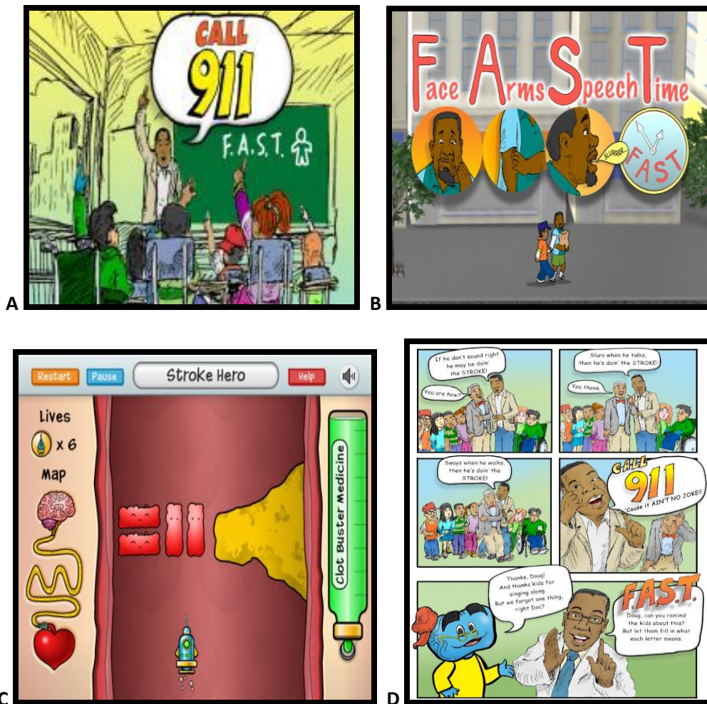
Figure 1: Hip Hop Stroke multimedia

LEGEND: A: Stroke Ain't No Joke cartoon. B. Keep Your Brain Healthy cartoon. C. Stroke Hero "Clotbuster" video game. D. Hip Hop Stroke comic